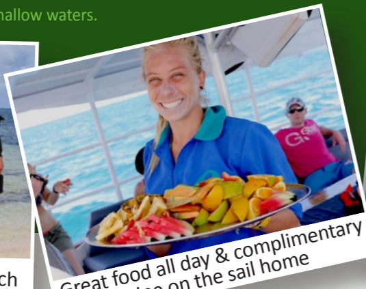
Great food all day & complimentary wine on the sail home