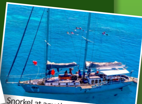
Snorkel at any time just off the boat