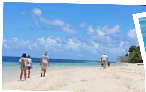
Relax, explore Green Island beach

Green Island is a truly tropical haven situated 26 km from Cairns on The Great Barrier Reef . Ocean Free sails you to Pinnacle Reef , an exclusive reef site located in the highly protected Marine Park zone just off Green Island offering excellent coral coverage and vibrant marine life. Its protected waters are the perfect location to discover the reef snorkelling or scuba diving . Experience the best of both worlds - the spectacular marine life on your private Great Barrier Reef site and then get taken straight to Green Island beach where you can explore the tropical island or just relax in the cool, crystal clear, shallow waters.