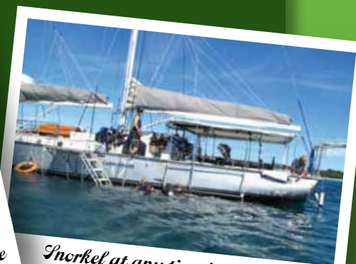
Snorkel at any time just off the boat