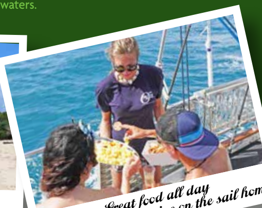
Great food all day & complimentary wine on the sail home