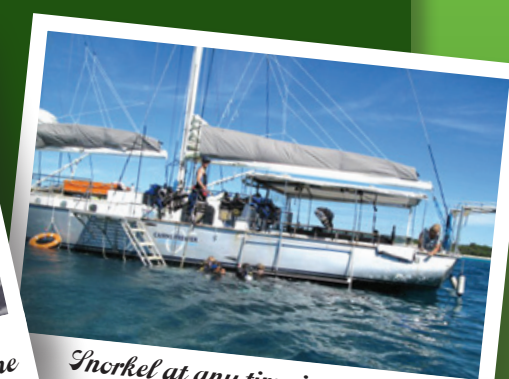
Snorkel at any time just off the boat