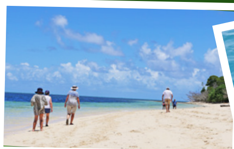
Relax, explore Green Island beach

Green Island is a truly tropical haven situated 26 km from Cairns on The Great Barrier Reef . Ocean Free sails you to Pinnacle Reef , an exclusive reef site located in the highly protected Marine Park zone just off Green Island offering excellent coral coverage and vibrant marine life. Its protected waters are the perfect location to discover the reef snorkelling or scuba diving . Experience the best of both worlds - the spectacular marine life on your private Great Barrier Reef site and then get taken straight to Green Island beach where you can explore the tropical island or just relax in the cool, crystal clear, shallow waters.