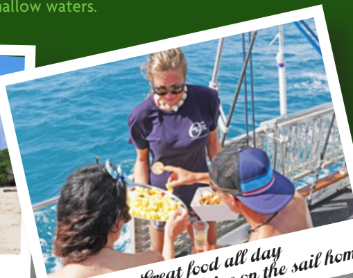
Great food all day & complimentary wine on the sail home