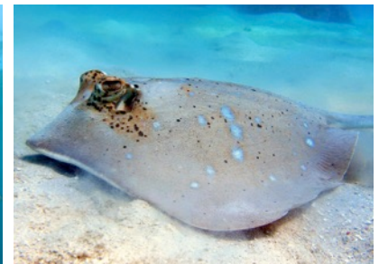
SEE ALL “HOLLYWOOD STARS !