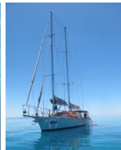
Snorkel straight off boat