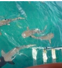
FISH FEED OFF THE BOAT