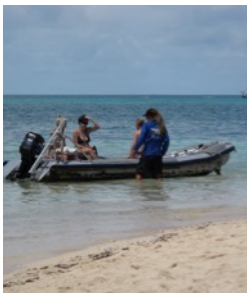
Visit Green Island – TENDER TAKES YOU straight to the beach