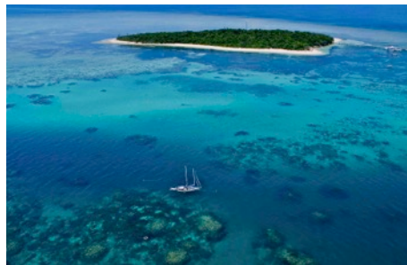
Exclusive Reef site - ONLY boat to have a reef permit here