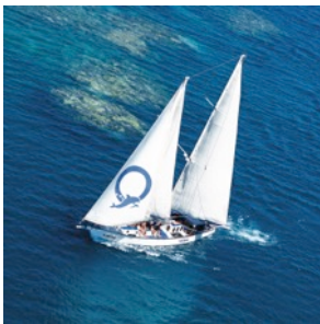
16M Schooner - Real sailing!

Demographics : Youth / Families / Adventurous 40-60 yr olds / Fit and adventurous retirees who are mobile and stable enough to move around a moving vessel and “willing to give it a go” - our crew are trained to service each of these “demographics” on any particular day – the specific selling point across these groups being extremely low pax number personal reef tour